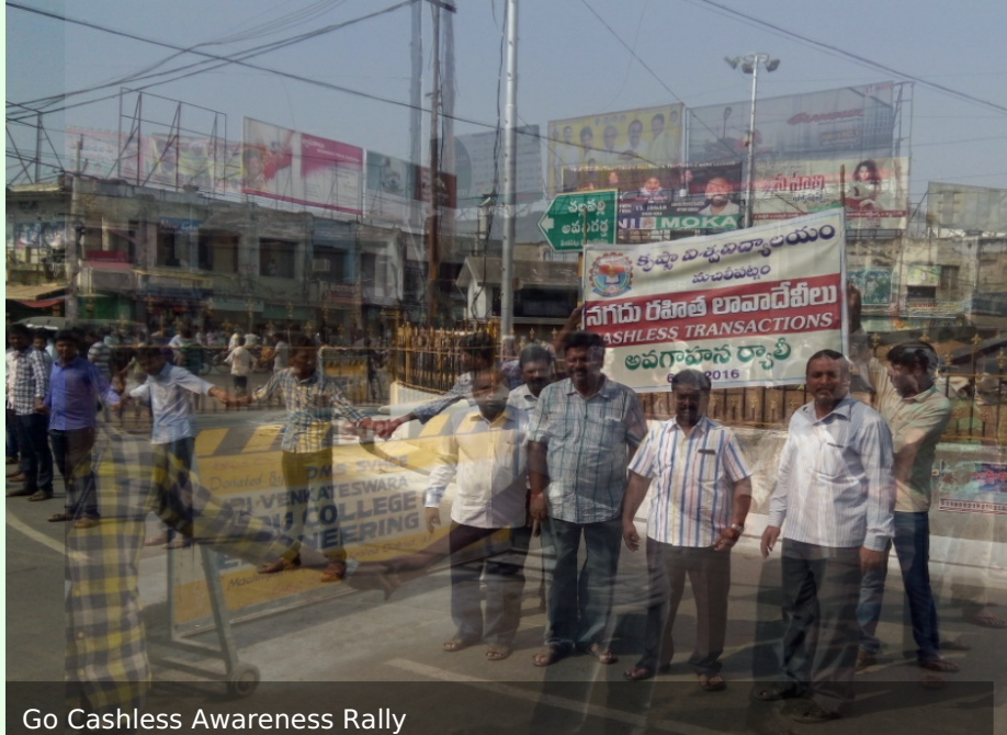
Go Cashless Awareness Rally

Contact Center for Research Studies Spoken tutorial programme by IIT-Bombay Revised Aff