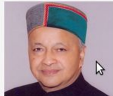
Sh. Virbhadra Singh Hon'ble Chief Minister Himachal Pradesh

Latest News: distribution of laptop academic session 2015-16