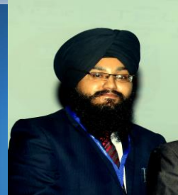
Spoken Tutorial IIT Mumbai