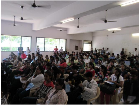
Participants from host institute and nearby colleges