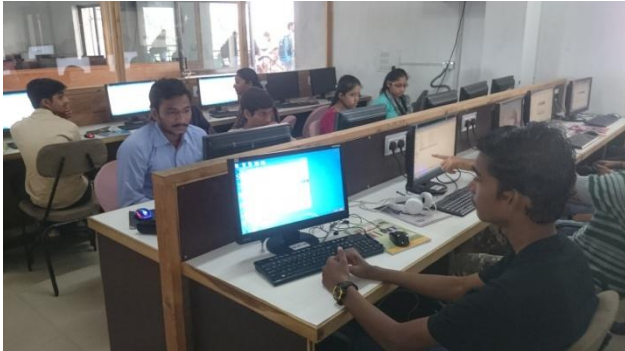
Participants engaged in hands on exercise for Libre office writer