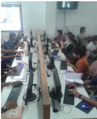
Participants engaged in hands on exercise for Libre office Calc