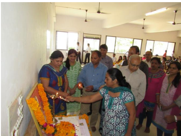
Lamp Lighting by dignitaries