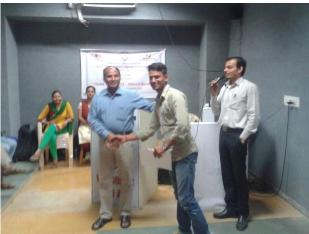
Prize Distribution to winners