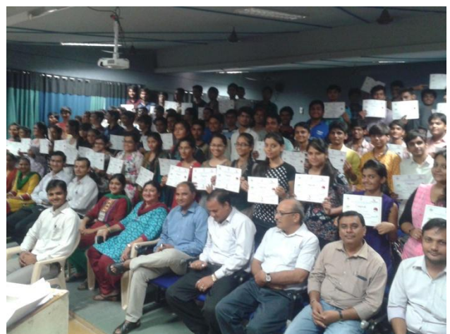
Participants with certificates