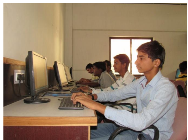
Write-O-Maniac competition (LibreOffice WRITER)