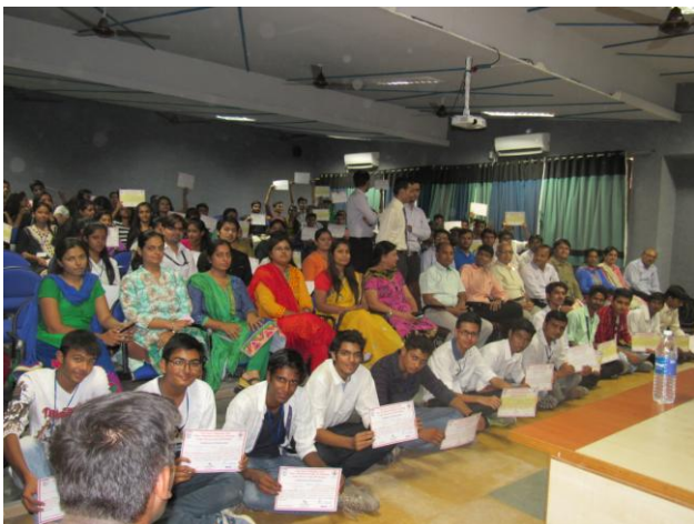
Participants with certificates