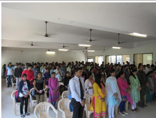
Prayer by participants and guests