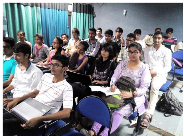
Participants engaged in hands on exercise