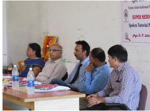
Dignitaries on the dias