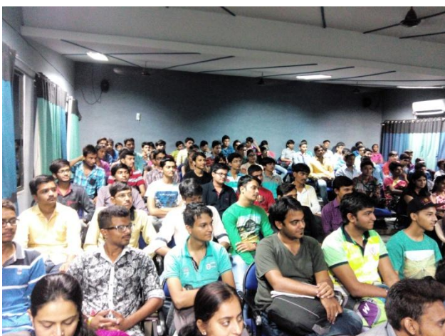
Participants watching side by side method video