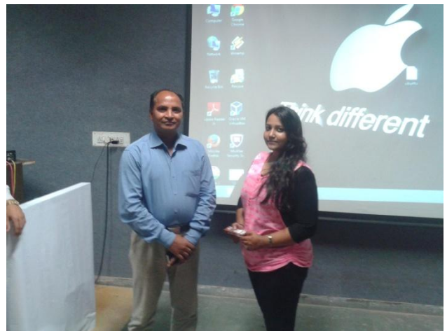
Prize Distribution to winners