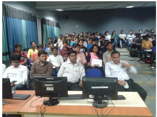
Participants of the workshop