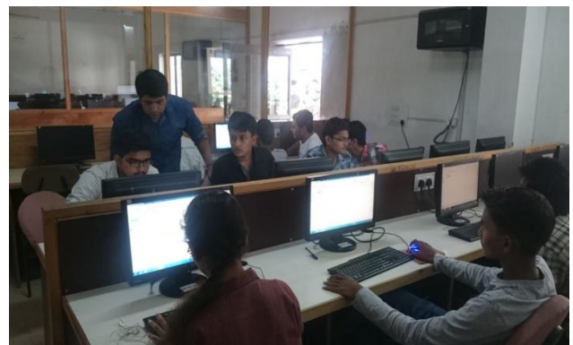
Participants engaged in hands on exercise for Libre office Writer