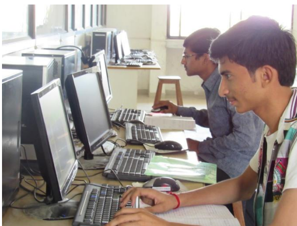
Interpreter competition (LibreOffice CALC)