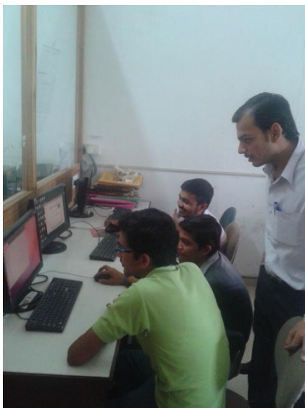
Participants engaged in hands on exercise for Libre office Impress