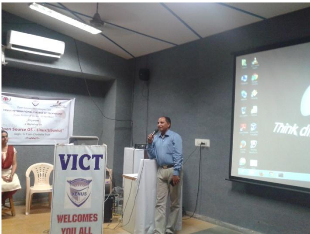
Inaugural Speech by Director – VICT