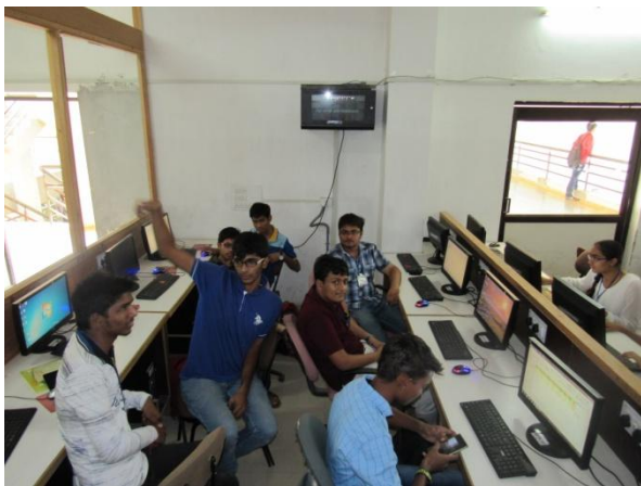
Presenter competition (LibreOffice IMPRESS)