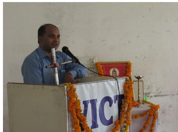
Inaugural Speech by Director - VICT