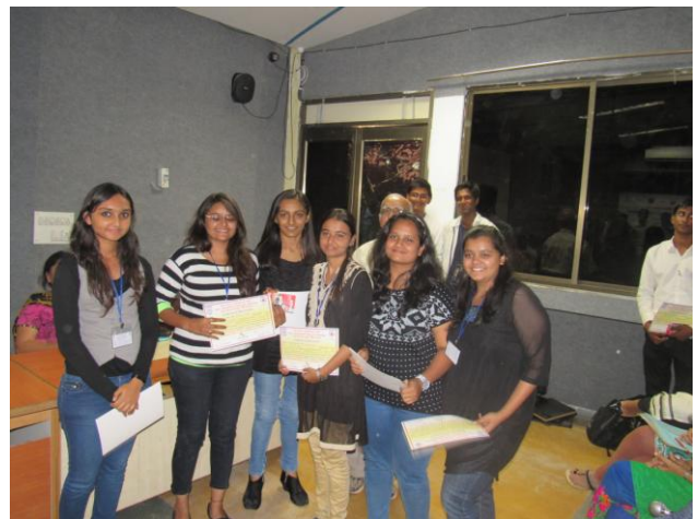
Participants with certificates