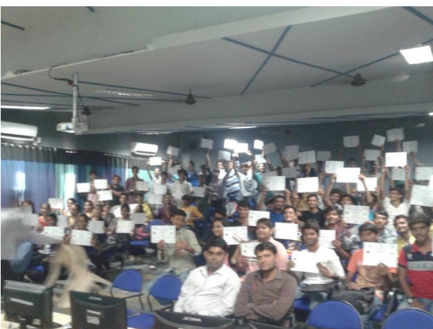
Participants with certificates