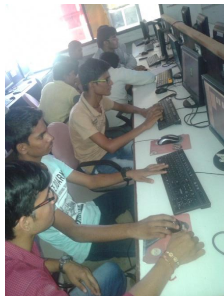
Participants engaged in hands on exercise for Libre office Impress