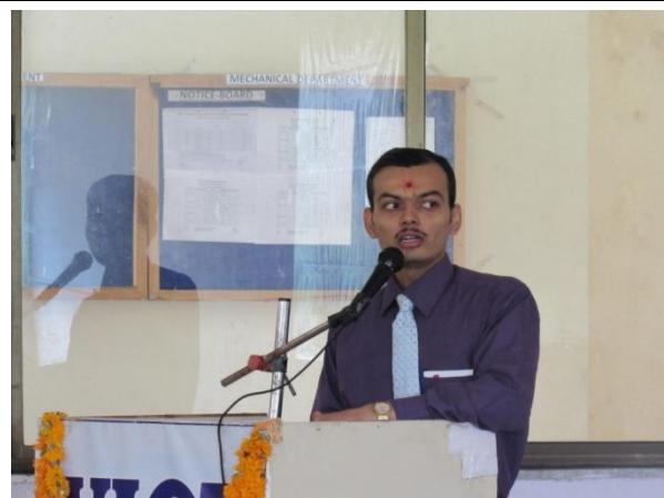
Welcome address by Event Coordinator