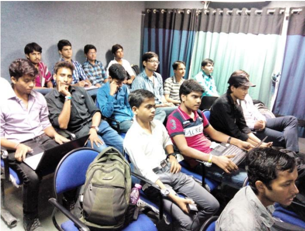
Participants engaged in hands on exercise