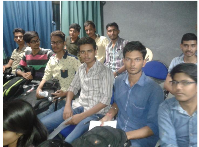
Quiz Competition after completion of workshop